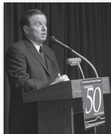
Jerry Mathers, star of the '50s television series "Leave It To Beaver" spoke at the Guilderland Public Library to kick-off our 50th Anniversary Celebration.