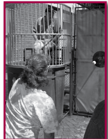
This Family Fun Day snap was taken a nanosecond before the seated Library staffer was dunked by a patron's well-aimed throw.