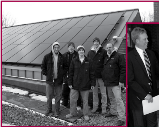
Above: The crew from ETM Solar paused after completing the installation of the Library's grant-funded solar panels.