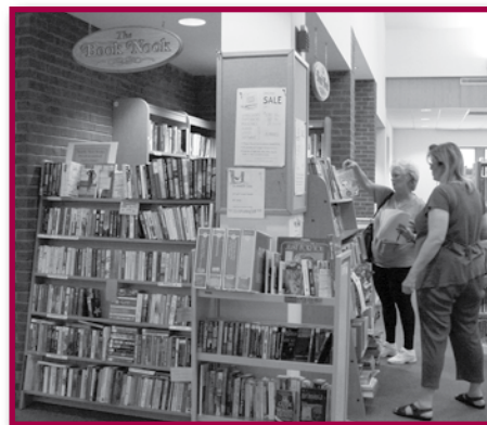
The Book Nook, a retail kiosk just inside the Library's doors, raised money for the Library through the sale of donated books and from those removed from the Library's collection.