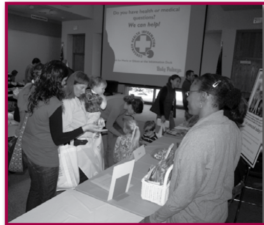
Baby Palooza gave parents their own "Baby Information Fair."

A very successful Baby Palooza was held with support from the Association of Library Trustees, Advocates, Friends and Foundations' "Babies Need Books" grant and the Friends of the Guilderland Library. Additionally, Older Adult Outreach programming and partnerships with assisted living facilities, nursing homes and Guilderland Senior Services continued.