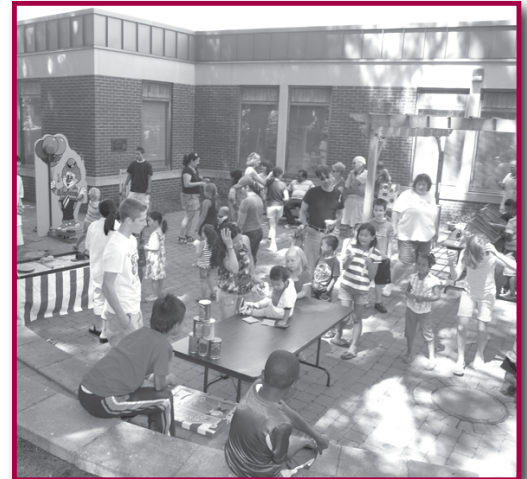
A record crowd turned out in the Community Literary Garden for Family Fun Day 2010. The day was graced by warm, sunny skies. The younger patrons had fun while parents took advantage of the time to sit and chat with friends and Library staff.